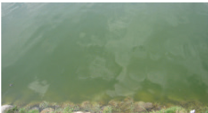
Fig. 1. Pond treated with PondPlus® showing stable bloom and green color, indicating a healthy pond.