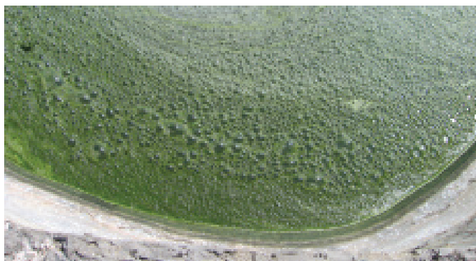
Fig. 2. Nontreated pond with turbid water, foaming and dark color caused by overbloom, indicating poor pond conditions.